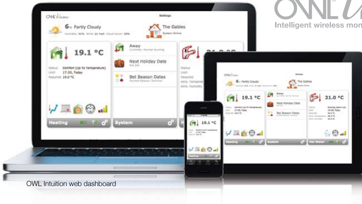
OWL Intuition web dashboard

OWNL ® intuition Intelligent wireless monitoring and control.